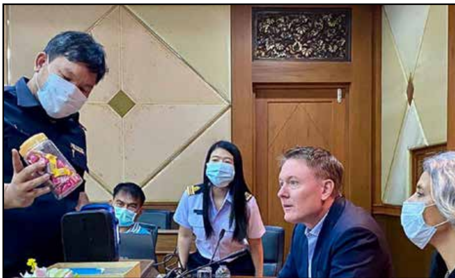
Gita Sabharwal, UN Resident Coordinator in Thailand (right), and UNODC's Jeremy Douglas (centre) receive a briefing at the Customs house in Mae Sai in the north of the country.

Chiang Rai's economy will probably remain largely based on agriculture, tourism and cross-border trade for the foreseeable future. In the agriculture and tourism sectors, innovative approaches are providing examples for a sustainable future. The Mayor of Chiang Rai City, for example, is promoting an approach that supports sustainable and chemical-free agriculture, connecting Chiang Rai's farmers with schools, hospitals and export markets.